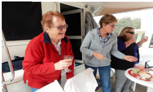
There was plenty of support and encouragement from the ladies