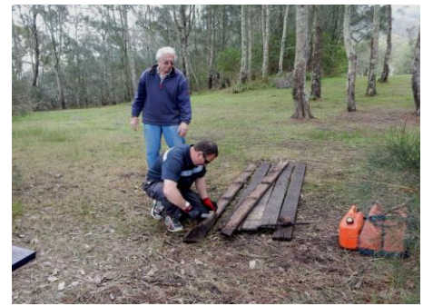
Improving the safety of the old Violet Hill wharf