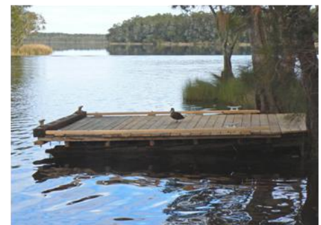
A job well done ☺