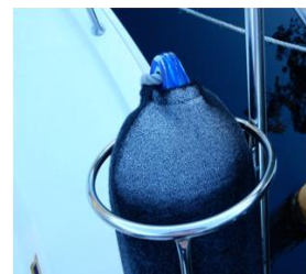
A touch of frost