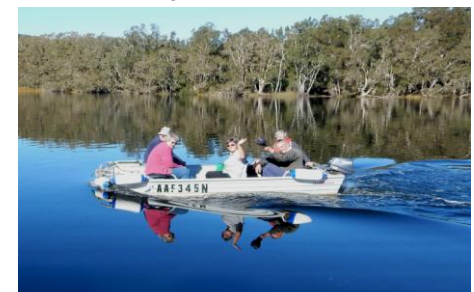
Gathering the crew for a magic Monday cruise of the western shores of Myall Lake.