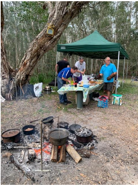
Captains, busy preparing the feast!