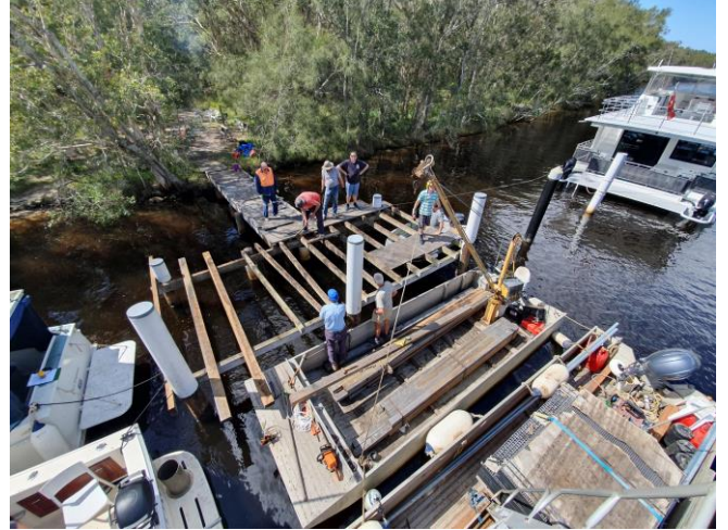
Engel's Wharf Rebuild